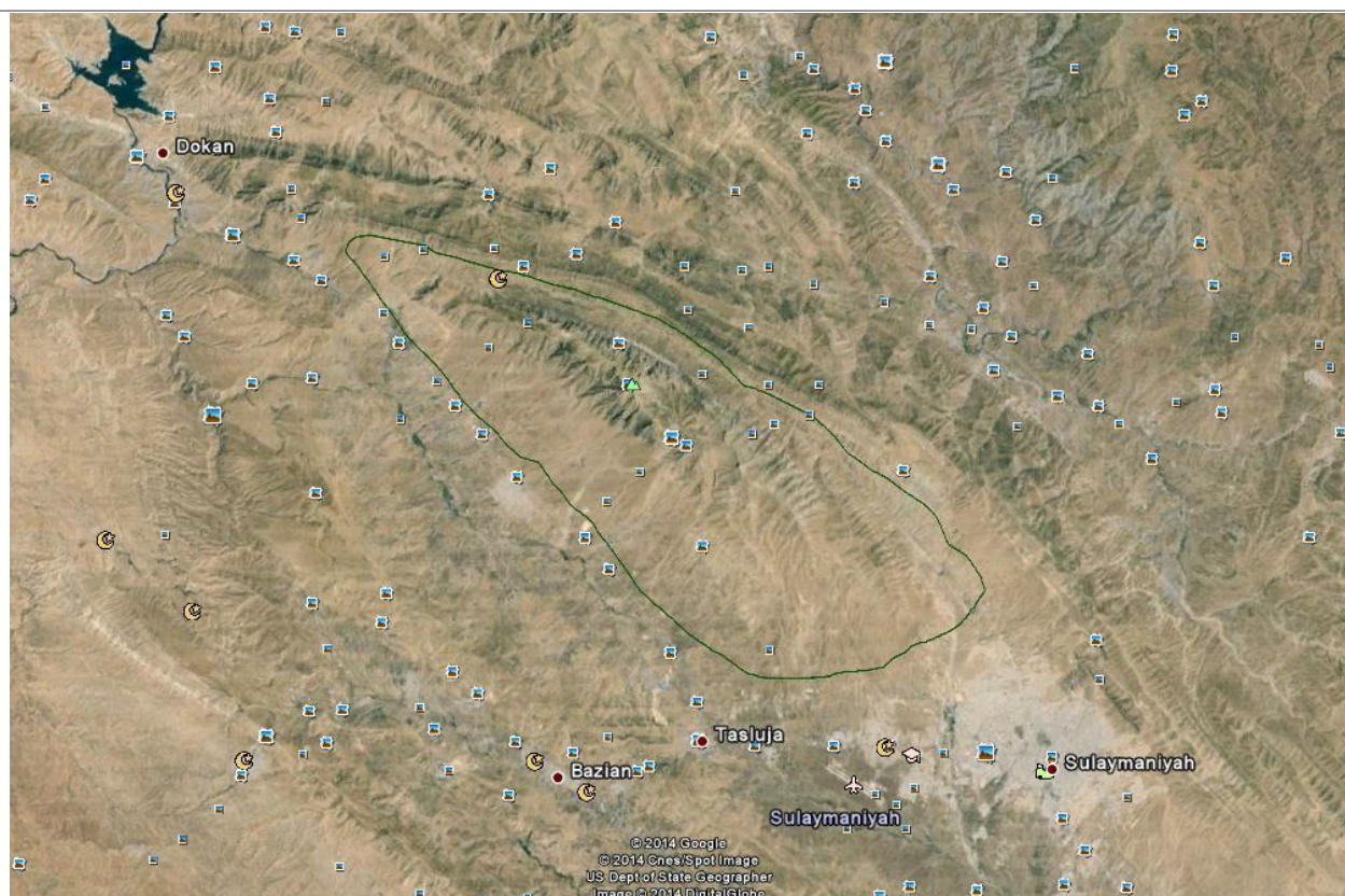
Map of Peramagroon Mountain, Kurdistan Autonomous Region, Iraq

The focus of these areas of work is Peramagroon Mountain, a mountain massif in Kurdistan, which is readily accessible from Sulaimani, meets KBA criteria, and has an eco-camp established by NI which can be used as a base for field based survey, training and educational programs.